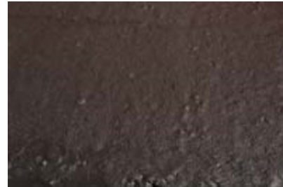
Step 6. GRR Flood Liquid will be black when it has completely dried.