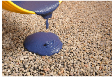
Step 2. Stir then pour GRR Flood Liquid onto gravel. (Note Blue color.)