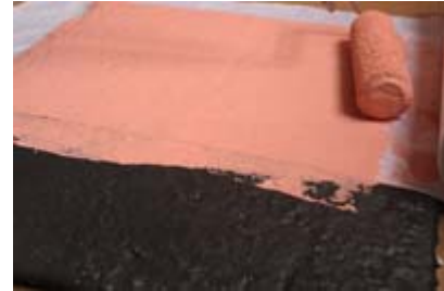
Step 9. Roll saturation layer of Sealoflex CT Pink into Sealoflex Fabric.