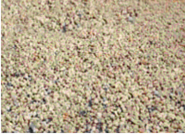
Step 1. Clean excess gravel from roof.