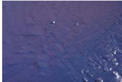
Step 5. GRR Flood Liquid will begin to change colors as it dries.