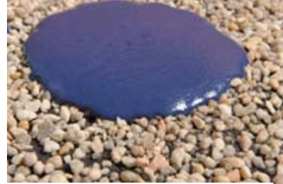
Step 3. Ensure good coverage of GRR Flood Liquid.