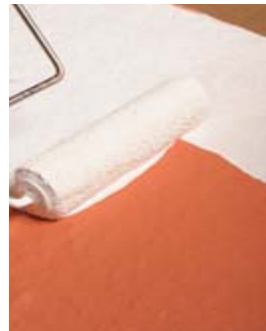
Step 12. Roll Sealoflex CT Top over CT Pink. Two coats required. See next page for photo of completed project.