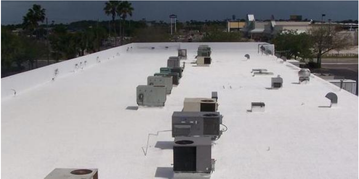
COMPLETED GRAVEL ROOF RECOVERY SYSTEM