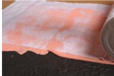
Step 8. Roll Sealoflex Fabric into wet Sealoflex CT Pink, embedding it into the Fabric.