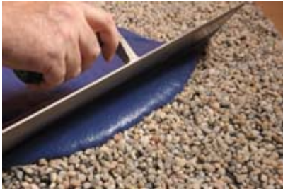
Step 4. Spread GRR Flood Liquid with trowel or squeegee over entire roof surface.