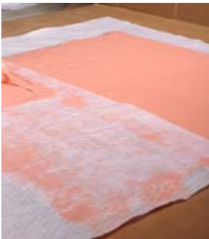
Step 10. Roll second row of fabric over first row, overlapping by 3" (75mm). Then roll saturation layer of Sealoflex CT Pink into fabric as in Step 9.