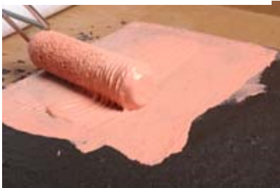
Step 7. Roll base coat of Sealoflex CT Pink onto dried GRR Flood Liquid.